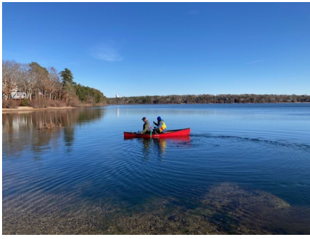
Pond Sampling for Nutrients