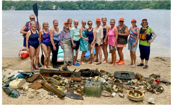
Old Ladies Against Underwater Garbage