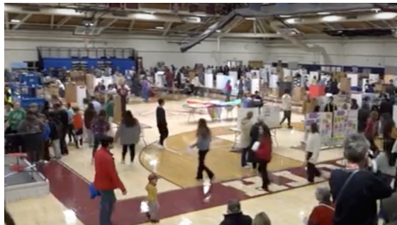
Falmouth STEAM (Science, Technology, Engineering, Art, & Mathematics Fair), Falmouth High School, 2024