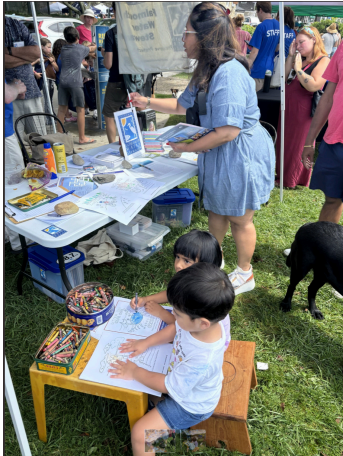
Woods Hole Science Stroll, 2024